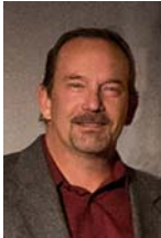
Chief Operating Officer